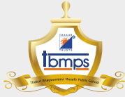
Thakur Bhagwanidevi Musafir Public School 2023