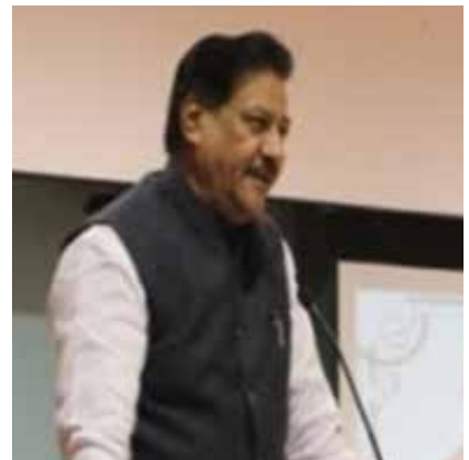
Shri. Prithviraj Chauhan Former Chief Minister, Government of Maharashtra