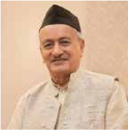
Shri Bhagat Singh Koshyari Former Governor, State of Maharashtra