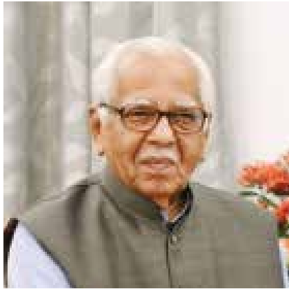
Shri. Ram Naik Former Governor, State of Uttar Pradesh