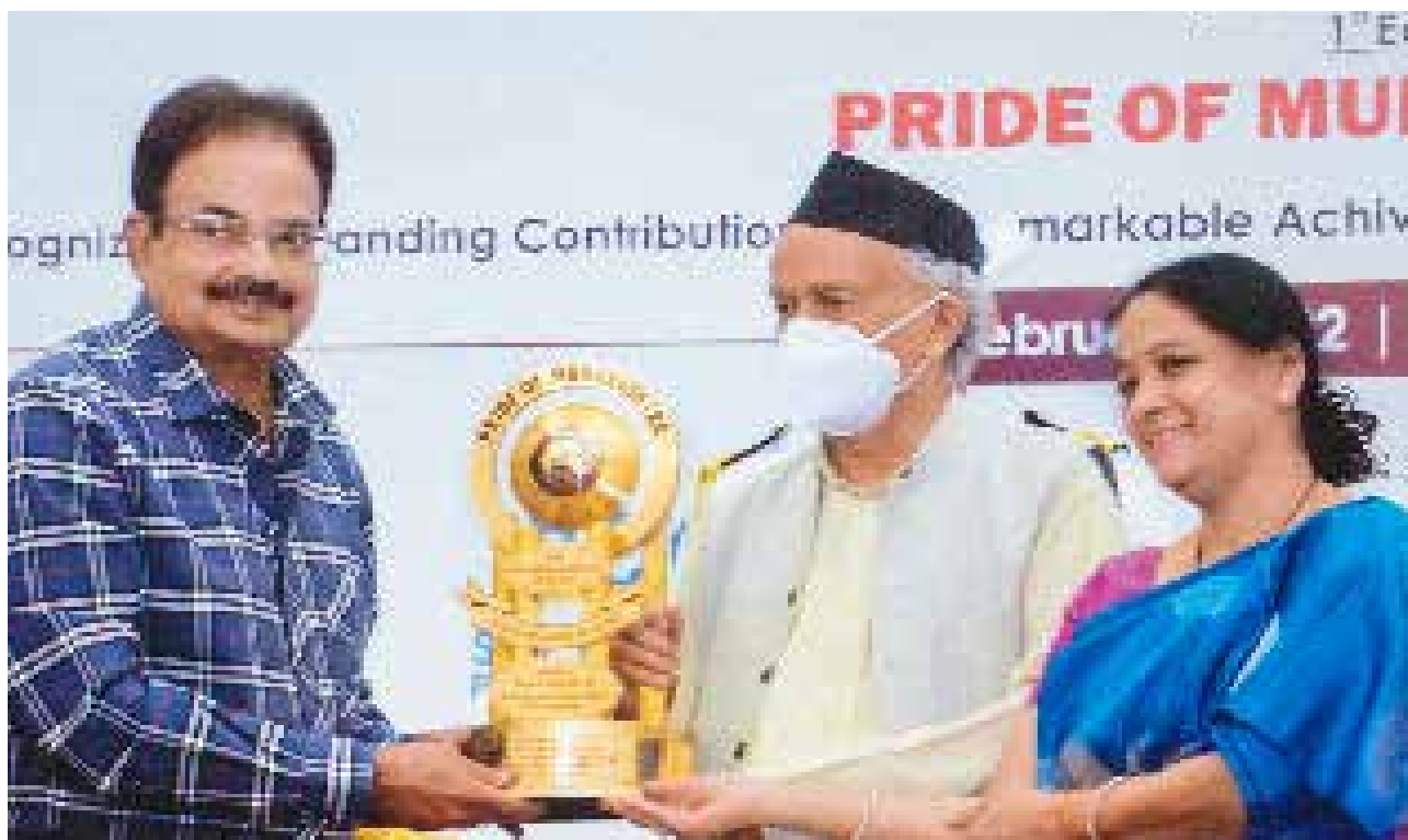
TCSC was awarded 12th Pride of Maharashtra Award 2021 at the hands of Shri. Bhagat Singh Koshyari Ex- Governor of Maharashtra on 13th February, 2022