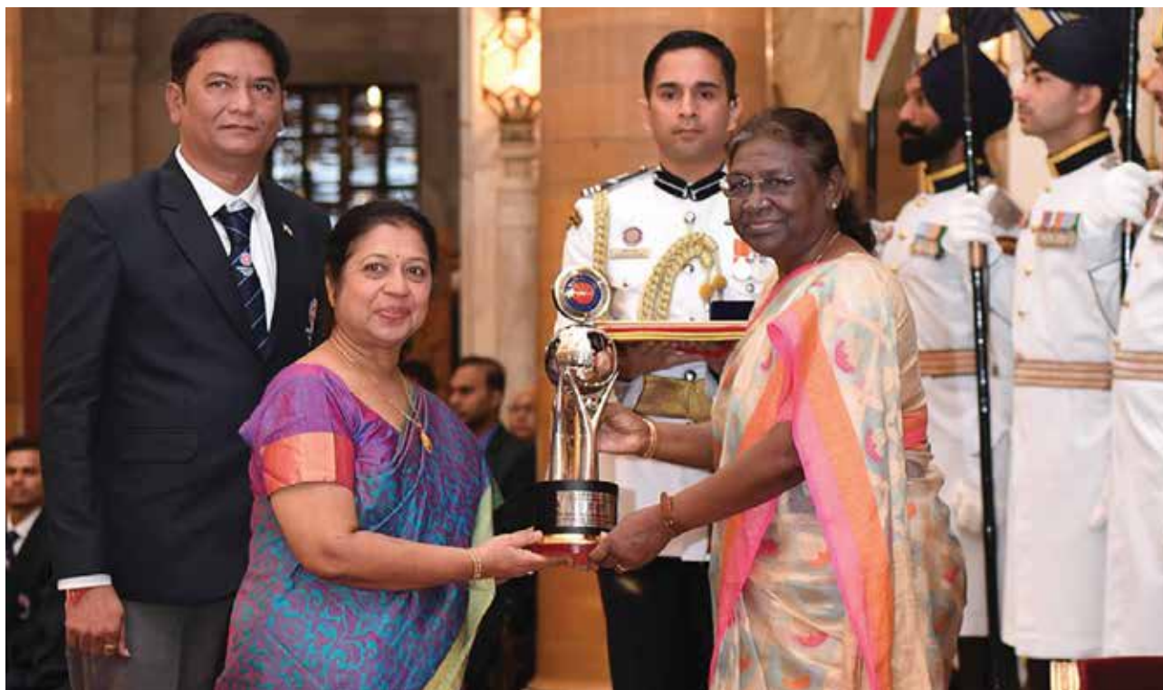
TCSC was awarded National Service Scheme Awards 2020-2021 from Ministry of Youth Affairs at the hands of Hon. President Droupadi Murmu at Rashtrapati Bhavan, New Delhi on 24th September, 2022.