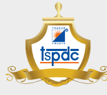
Thakur Specialized Degree College 2023