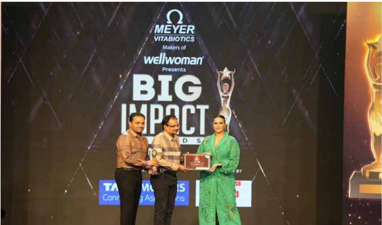
TET was awarded Big IMPACT Creator in the Category of Education & Training Institutes (Mumbai) at 2nd Edition BIG IMPACT AWARDS by BIG FM for entrepreneurial excellence and exceptional efforts of impact markers on 28th February, 2024